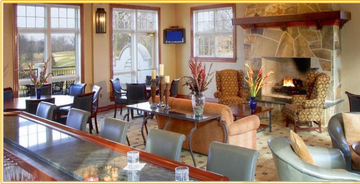
Casual Bar Area