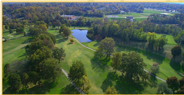
NHCC feature's Two eighteen-hole Championship Golf Courses