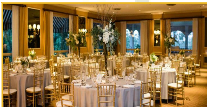
Ben Hogan Ballroom

Today, Norwood continues to provide its members with an experience like no other. Our Members enjoy a great social experience in all areas, from holiday events to daily dining to the swimming pool, fitness center and tennis courts, we have it all covered.